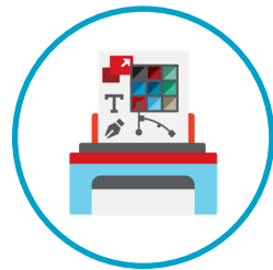
Production, DTP, & Graphics